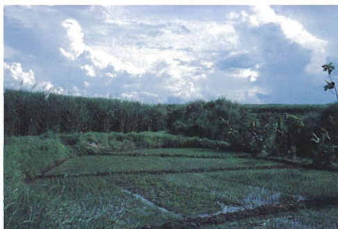
Plate 10. A diverse landscape in tropical Southeast Asia provides a haven for more than one species of rat.