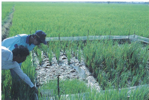
Plate 9. Milky ripe and freshly transplanted rice are used as a 'trap crop' at Pinrang, South Sulawesi. Multiple capture traps can be seen in each corner of the fence.