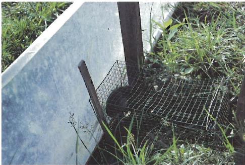
Plate 7. A physical barrier with a trap in position. This method was developed in Malaysia.